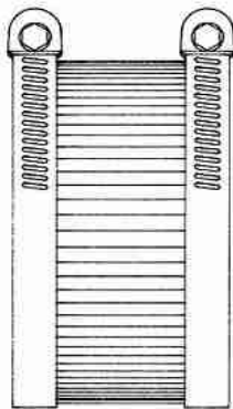
Size 1/2" THRU 4"

Meet Specifications ASTM C1277 and ASTM C564